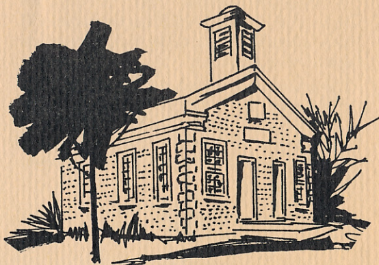
1849 COBBLESTONE SCHOOLHOUSE, CHILDS

In 1960 cobblestone enthusiasts organized the Cobblestone Society in Childs, New York to halt the gradual destruction of these landmarks. All people interested in preserving and restoring examples of cobblestone masonry are welcome to join this organization, chartered under the laws of New York State.